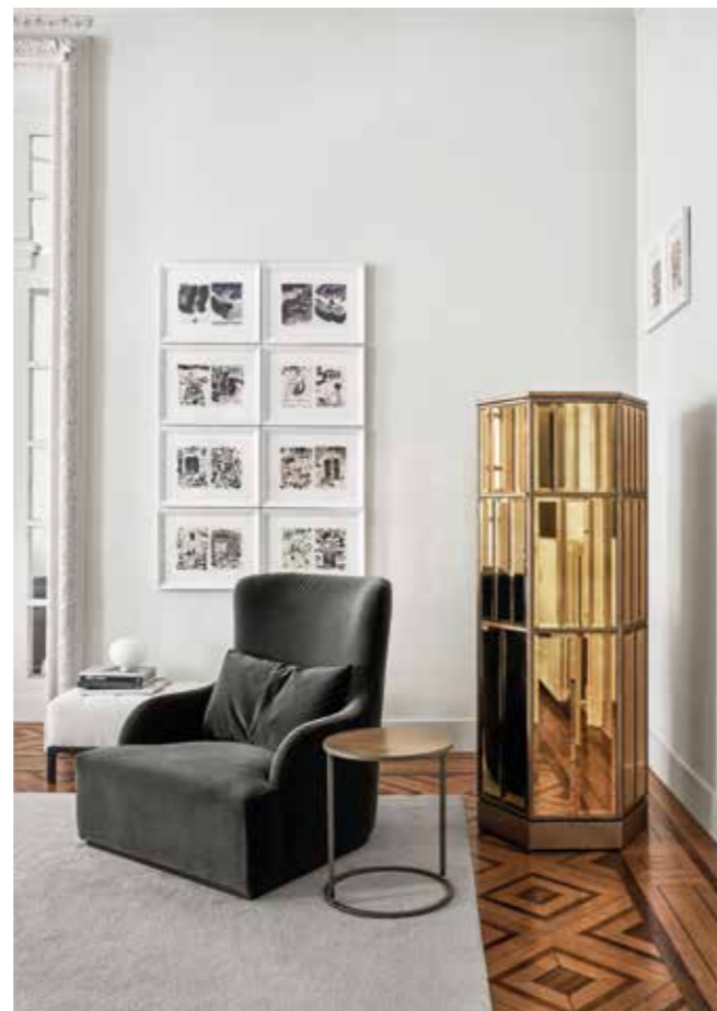
LUDWIG DIAMOND madia . cabinet LIU SKIN bergère PEK tavolo basso . low table