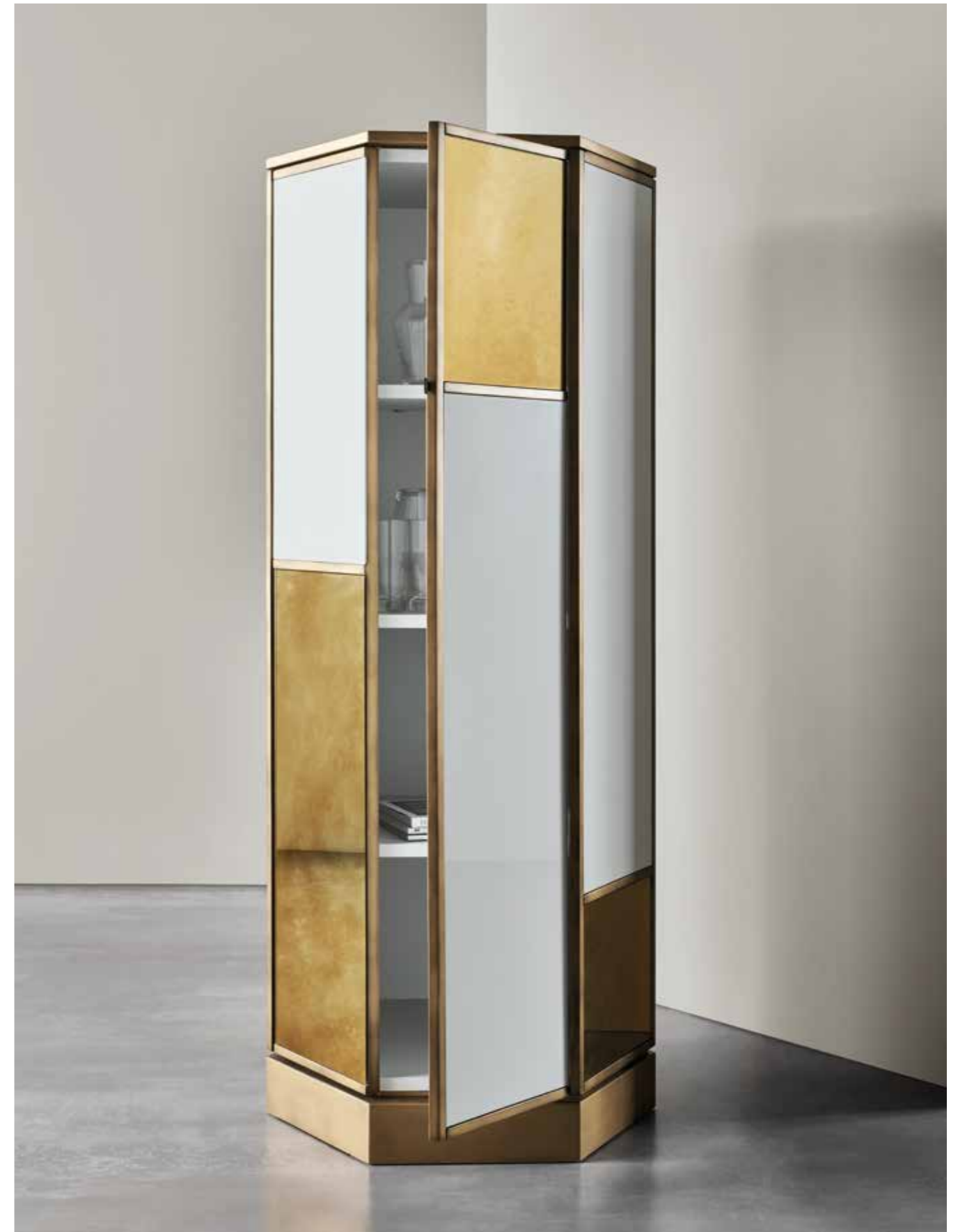
P. 231 LUDWIG madia . cabinet