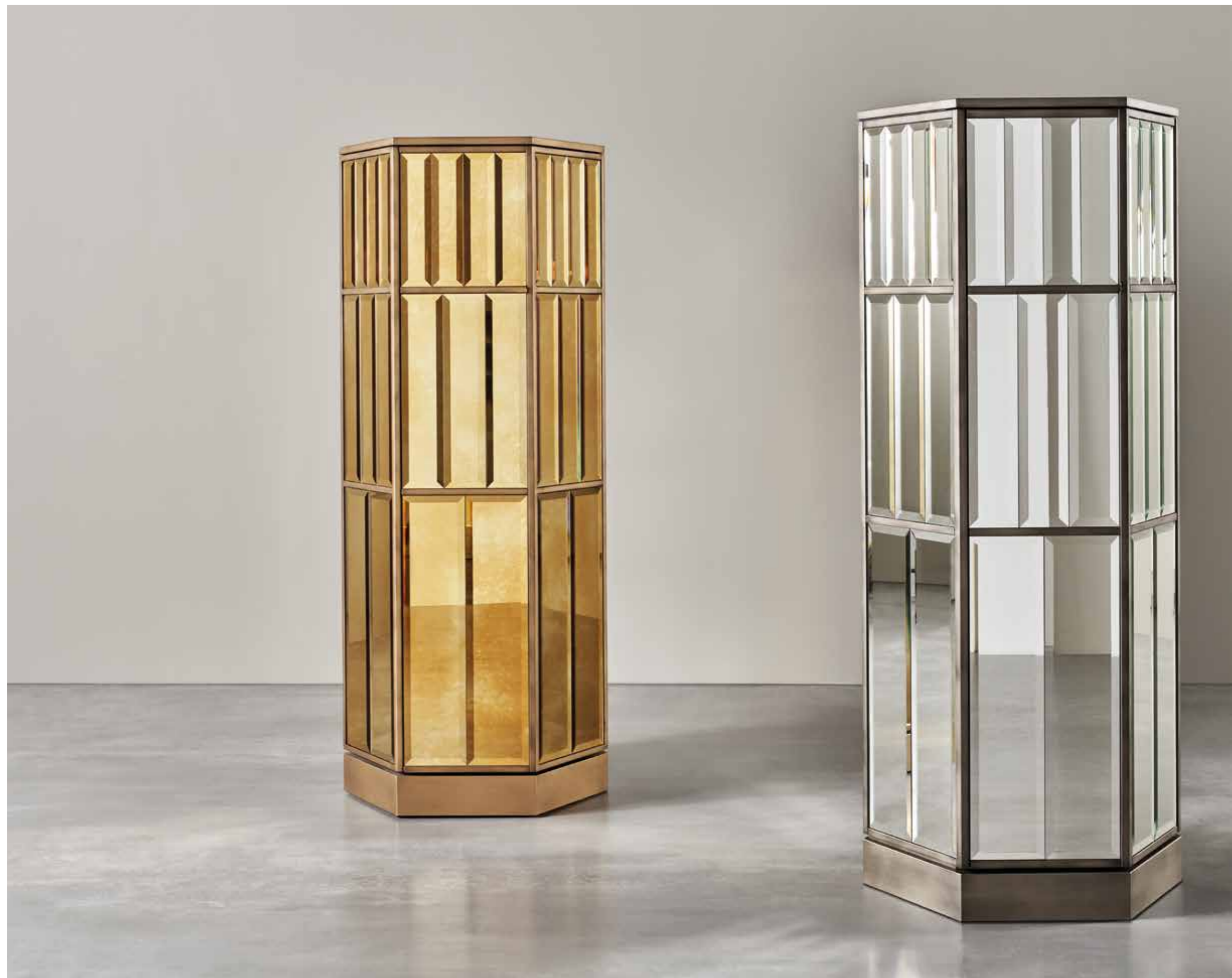
LUDWIG DIAMOND GOLD madia . cabinet LUDWIG DIAMOND PLATINUM madia . cabinet